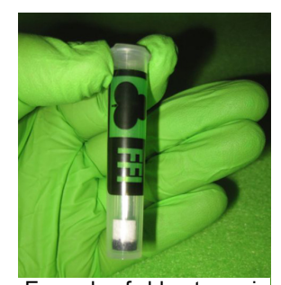
Example of chlorate positive, sampler tip turns from white to dark blue.