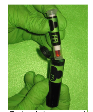
Tester being removed from outer package.