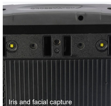
Iris and facial capture